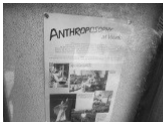
Illustration 2: Anthroposophy Flyer, Behind Glass

Transcription from Illustration 2: Anthroposophy at Work