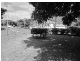
Illustration 5: The Back Of The Sign