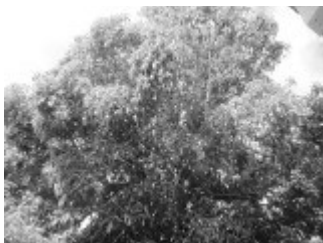
Illustration 4: An Anthroposophical Mango Tree