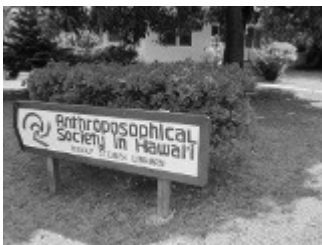
Illustration 6: The Front Of The Sign