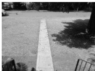
Illustration 1: The Walkway, As Seen From The Top Of The Steps