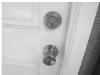
Illustration 3: The Locked Door

help heal the earth as well as to produce uniquely nutritious foods.