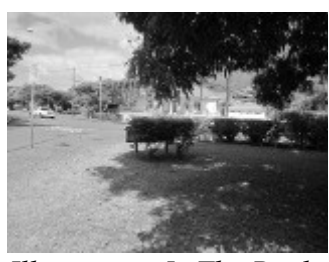
Illustration 5: The Back Of The Sign