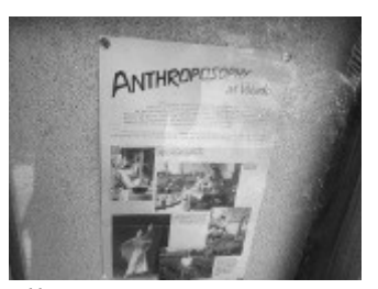
Illustration 2: Anthroposophy Flyer, Behind Glass

Transcription from Illustration 2: Anthroposophy at Work